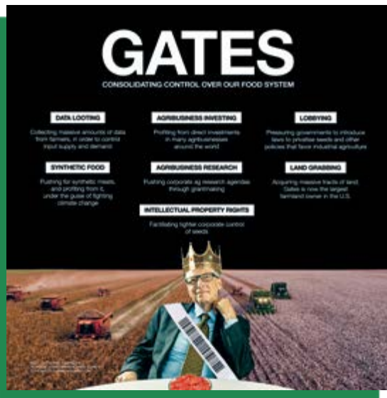
A Growing Culture developed a meme series based on GRAIN's report, cross-posted on our Instagram account. Traffic to GRAIN's website skyrocketed the day we published the report, it was picked up in multiple media outlets and was one of the most downloaded and most viewed articles on our website for 2021.

data collection systems , digital banking, chatbot advice and, of course, retail platforms. The implications for small farms and farmers are threats of increasing monopoly and vertical integration of the food system by corporate actors. Those who hold the data hold the power in this digital age. No one represents this better than Bill Gates, the largest farmland owner in the United States and a huge funder of industrial agriculture through the Gates Foundation.