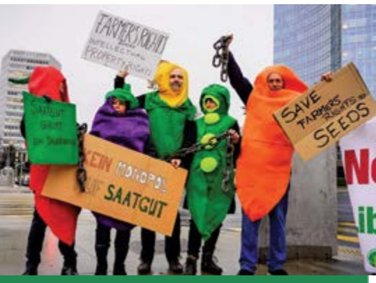
Farmers group and NGOs protested in front of UPOV headquarters in Geneva against the privatisation of seeds and symbolically liberated their crops from the chains of UPOV.

The Stop Golden Rice! Network (SGRN) is a regional coalition across Asia against Golden Rice. Events this year included coordination