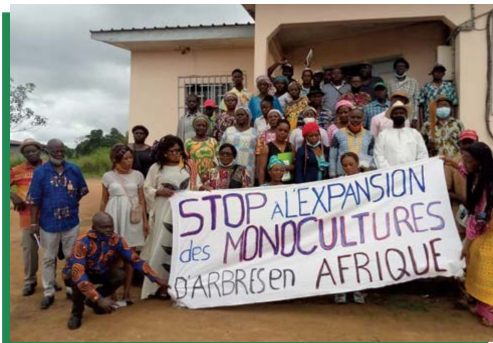
Muyissi Environnement Gabon gathers during the general meeting of the oil palm alliance in N'dolou at Mandji with a banner reading, Stop the expansion of tree monocultures in Africa.

Also this year, the Permanent peoples' tribunal formally accepted the petition brought by the Campaign in defence of the Cerrado. Over 50 organisations came together for over three years to prepare the documentation, testimonies, legal arguments and demands that made up the 15 cases of the petition. The first hearing on water took place in December. Additional hearings and final sentencing will take place in 2022.