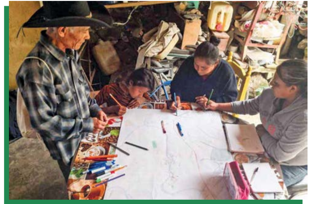
Workshop in Chila, Mexico, reconstructing the spatial history of their region.

A multi-year research process, in deep relationship with the regional council for indigenous peoples in defence of the Puebla-Hidalgo territory and the Centre of Studies on Changes in Rural Mexico (CECCAM), collectively documented the impact of Mexico's Tuxpan-Tula pipeline. This was gathered into an electronic book in Spanish titled Territories of water . Just as pipelines cross territories and borders, so does the planned resistance: the affected communities across Mexico have started to connect with communities organising against pipelines of the same company in Canada.