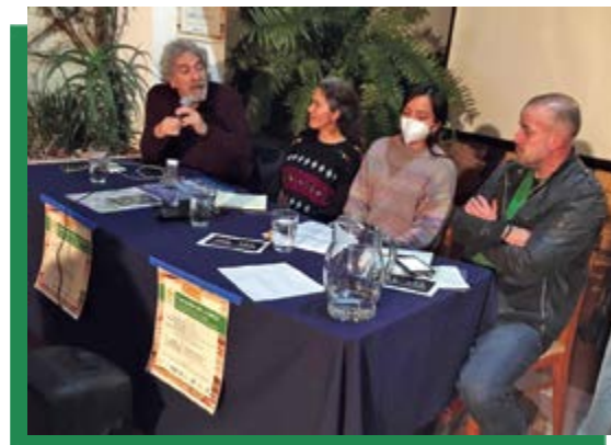
Members of the Network in defence of maize, including GRAIN, hosted a panel event in Mexico City as part of the #StopUPOV campaign activities in December.